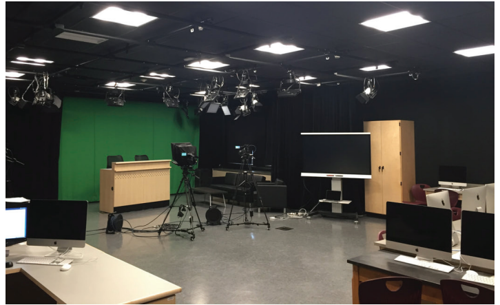
Studio with all the latest Gear