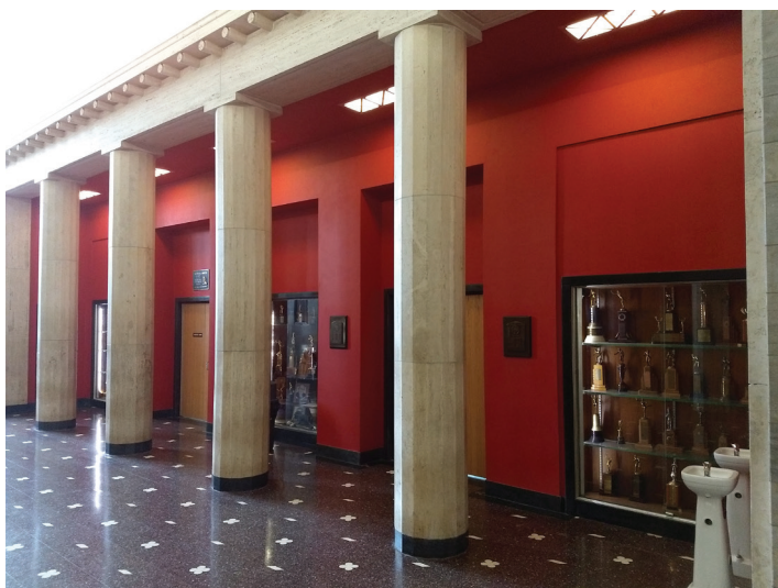
View with Trophy Cases