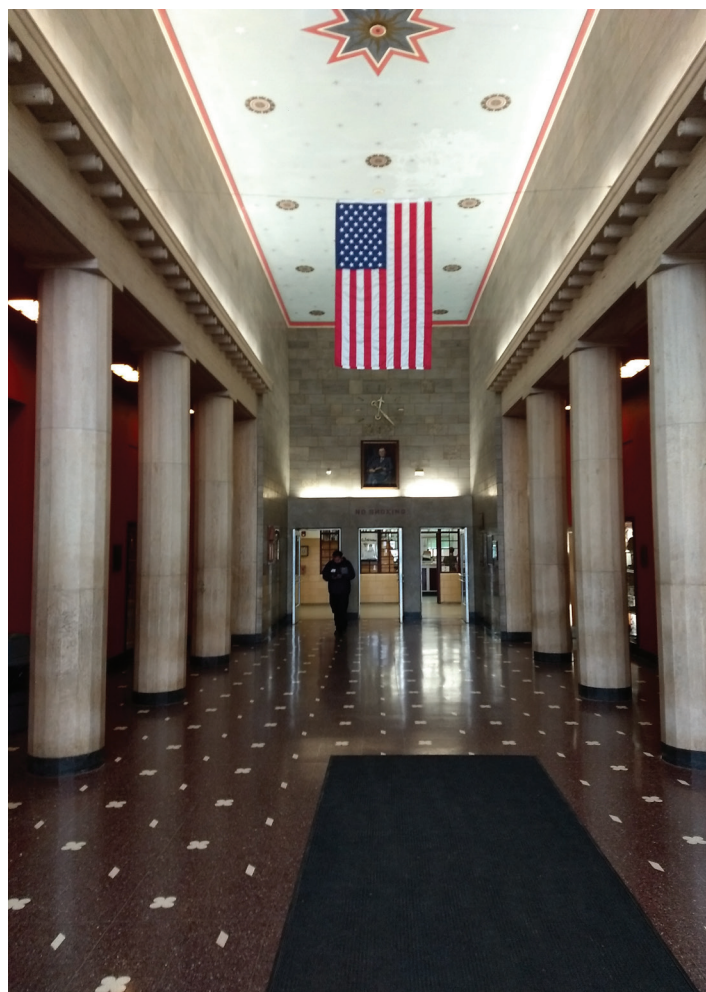
Foyer Ceiling, Columns and Floor